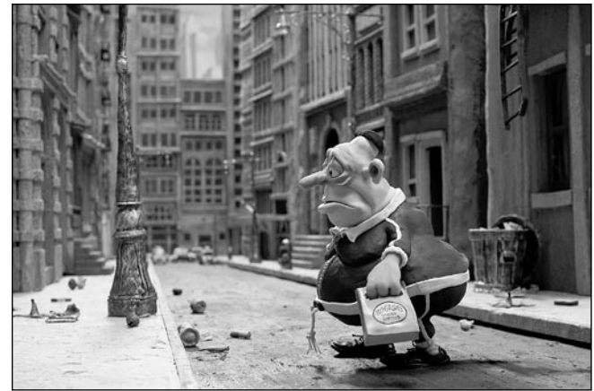
Max (Philip Seymour Hoffman) exists in a bleak landscape, both within his mind and without.

By chance, the two begin conversing when Mary writes to an American, chosen out of a phonebook, to ask where babies come from in America. Max writes back, “I asked my mother when I was 4 and she said they came from eggs laid by rabbis. If you aren’t Jewish, they’re laid by Catholic nuns. If See “Tale” on page 5